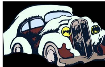
Parking regulations are enacted to provide for the efficient, effective and economical removal of snow.

shall be permitted, if not otherwise prohibited, whenever the entire length of roadway that block has been cleared of snow from curb to curb.