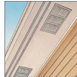
Soffit Vents Commonly found now with 2 sizes of openings: 3” x 14” & 7” x 14”