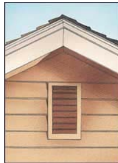
Gable Vents Typically sized adequately for the structure, but be sure the vents function fully.