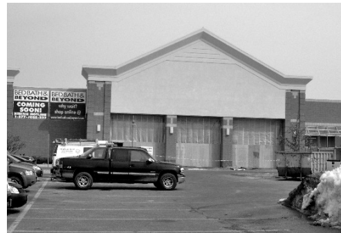
Construction is underway on Bed, Bath & Beyond, which will occupy the former Linens-N-Things space at Riverdale Village.

The City has issued building permits for several new retail stores, including Dick's Sporting Goods and Bed, Bath, & Beyond in the Riverdale Village shopping center at Highway 10 and Main Street. With over 3 million square feet of retail space, the Riverdale area boasts one of the region's lowest retail vacancy rates. In addition, Osaka Sushi & Hibachi is set to open in the Springbrook Mall at 85 th and University Avenues.