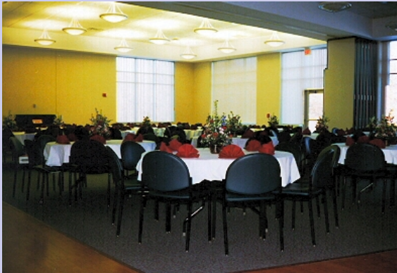
Civic Room A & B